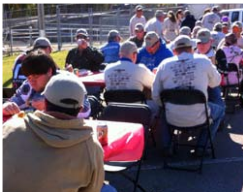
Soldiers and guides were treated to a big lunch at Fleet Harbor after their time fishing on Wilson Lake.

We will never be able to thank them enough.