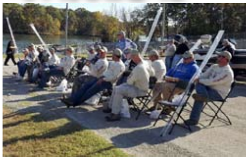
Soldiers and guides with some of their "goodies".

of the major sponsoring companies each of the three years held. We provided an assortment of Slider Lures for the Soldier "happy bags" in addition to lures and a new Slider rod for draw prizes.