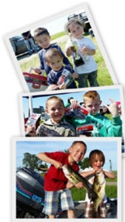
Beale Air Force Base Fishing Derby for kids.