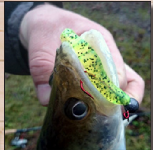
A close-up showing the Double Action Grub rigged on a jighead.

The German angler noted the Slider Double Action Minnow, in chartreuse and black flake, drives the perch and zander into a frenzy