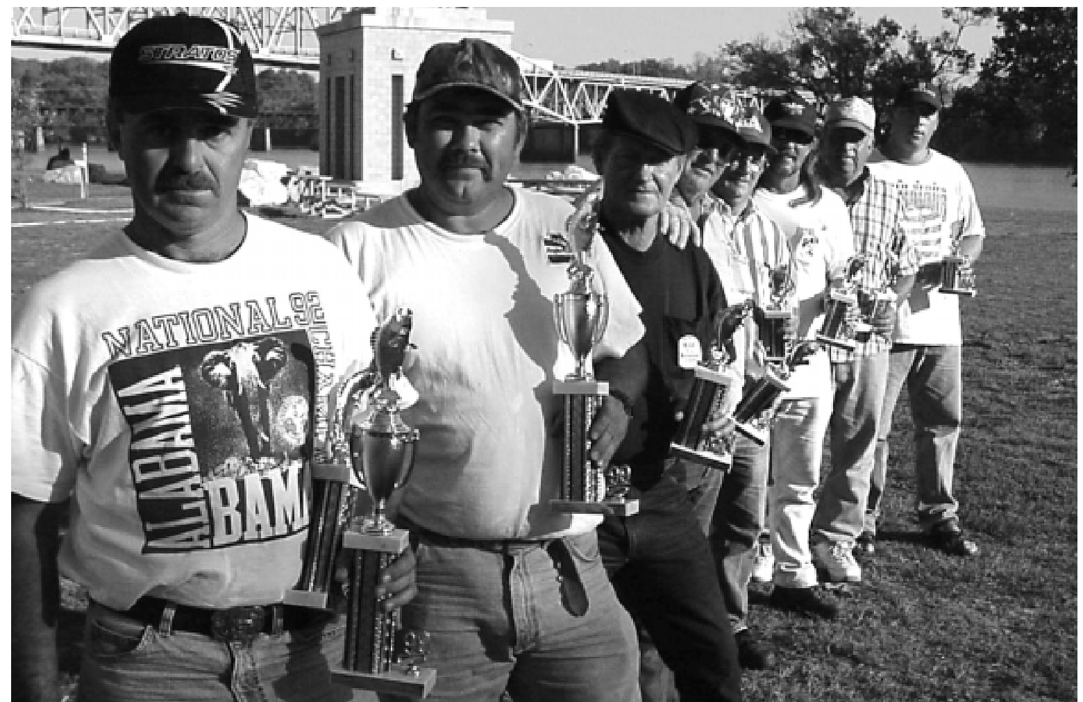
Southern Fishing photo