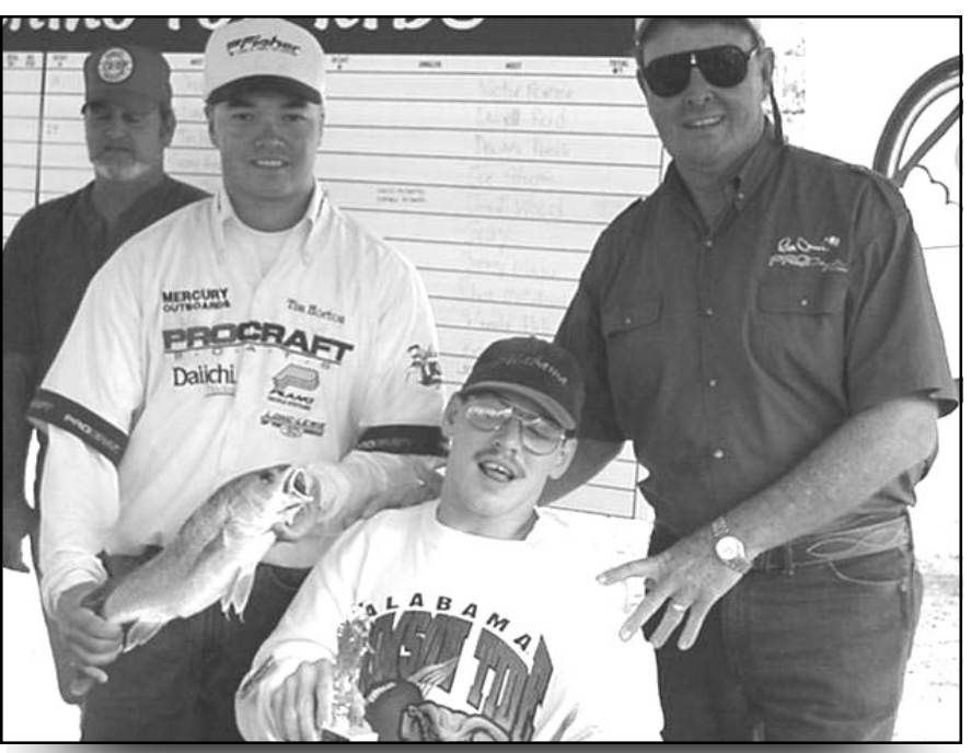
Southern Fishing photo

Thirty local anglers donated their boats and time to take one or two kids fishing that rarely, or never, have the opportunity to fish. The rules were simple-bring in just about anything you can catch-bass, stripe, catfish, bream, shad, or drum. Crickets, bobbers and artificial lures were to use by the youngsters. One youngster even had a small turtle in her bag. Winning and the size of the fish was not the point. It was all about just going fishing.