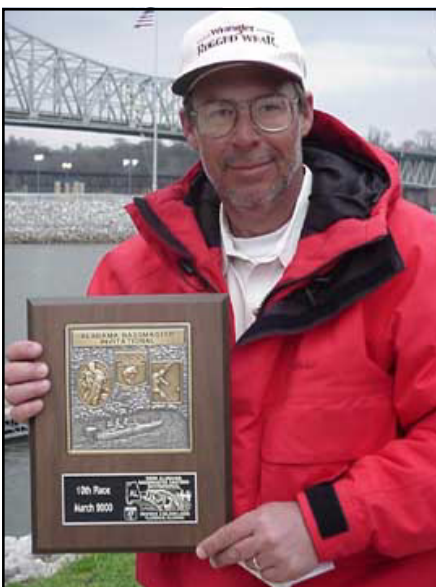
Southern fishing photo

Yes, the state is supposed to keep up with growth