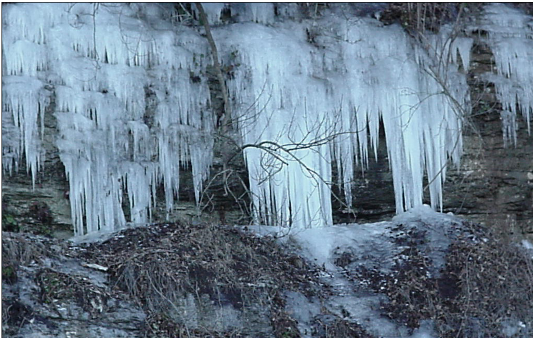
Southern fishing photo

The icicles on a bluff overlooking Pickwick are a testament to the cold weather that has driven water surface temperatures down into the mid-thirties which evidently contributed to a near-dormant bass population.